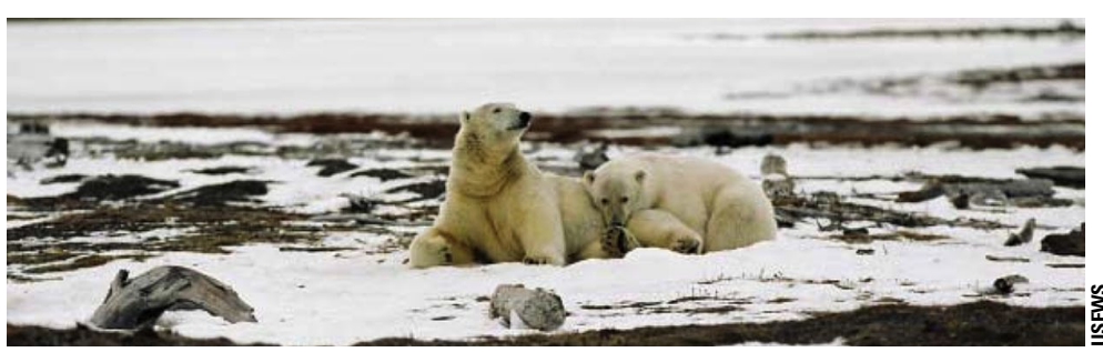
A female polar bear with her cub within the Arctic Refuge. The polar bear was listed as threatened in May of 2008 due to shrinking sea ice habitat.

The Arctic Refuge contains undisturbed lands ranging north to south across five different ecological zones: lagoons, beaches, and salt marshes in coastal